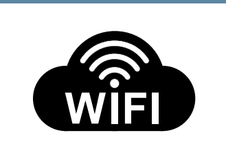
Built in Wi-Fi