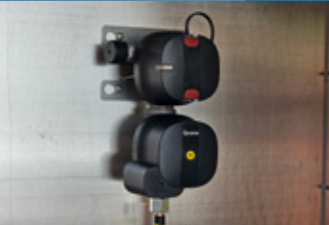
Truma Drivesafe Duo gas changeover regulator