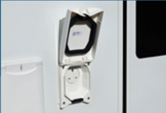
Exterior 230V socket