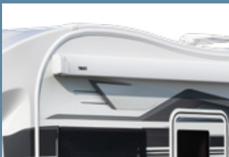
NEW Thule awning