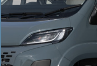
Ultra LED headlights including wash wipers and Auto lights