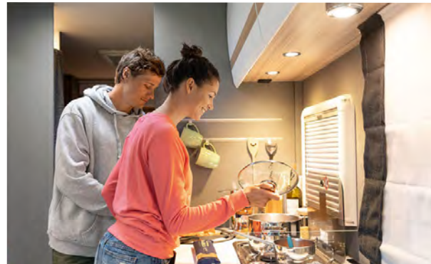
The 2-burner cooker has a practical, foldable cover and an electric ignition