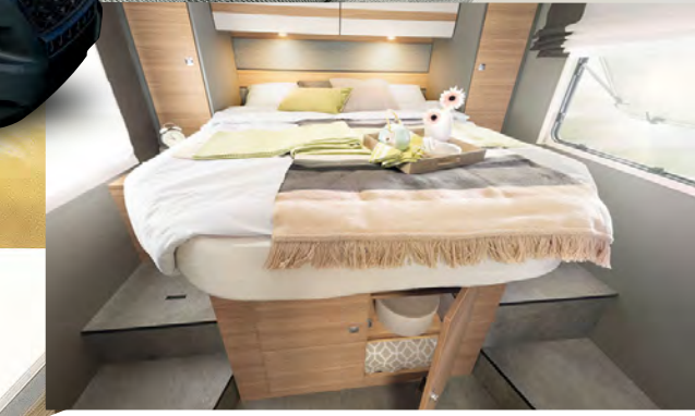
Comfortable and practical: the queen size bed is accessible from three sides

Built exclusively for Lowdhams and the UK, Dethleffs have created a tailor-made specification with a choice of two great floor plans. When you add the exceptionally priced XTRA Special Edition k with Dethleffs Lifetime body construction you get a truly irresistible motorhome range in one package.